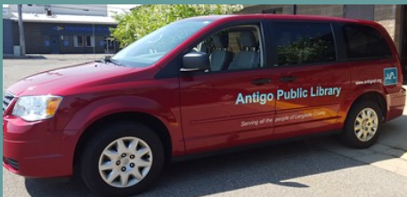
Antigo Public Library Outreach van

Give us a call at 623-3724 if we can be of assistance!